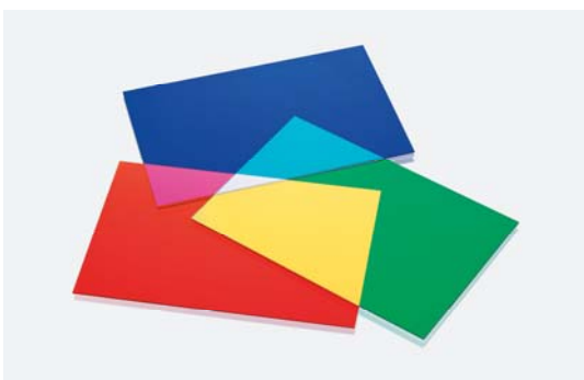
Fig: Dichroic Filters by Optics Balzers

Although optical oxygen sensing has not yet been utilized in medical applications, it is a state-of-the-art, long-established analysis technique used in chemical laboratories, especially when measuring dissolved oxygen in liquids. Typical industrial applications include, among others, beer brewing. When it comes to water monitoring, fermentation process control in bioreactors, and oxygen sensing, Optics Balzers' dichroic filters have proven to be more than up to the task.